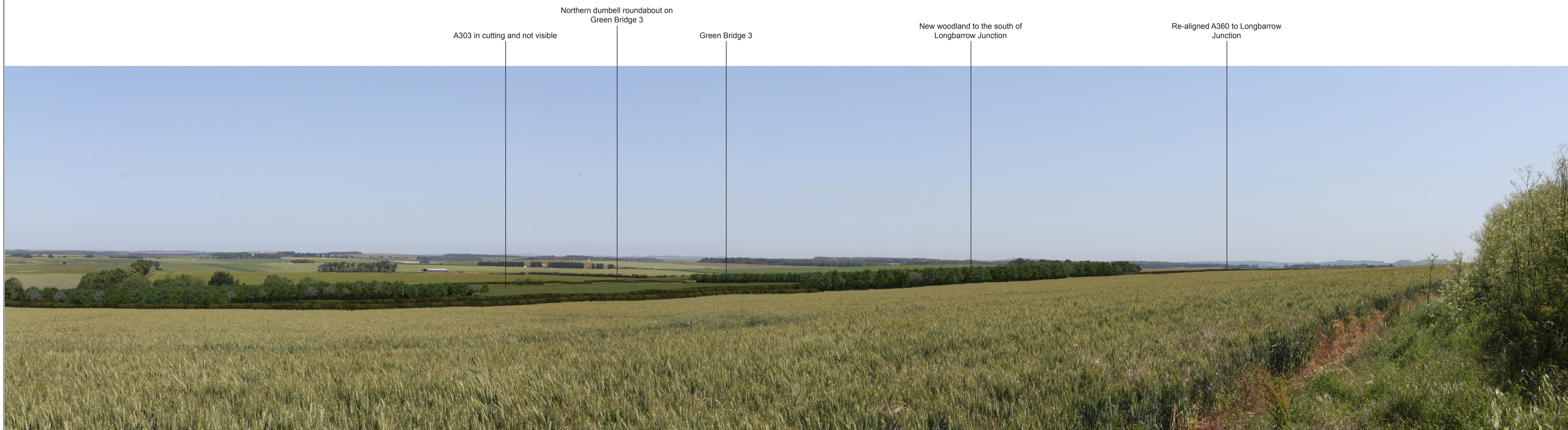
PROPOSED (SUMMER YEAR 15)